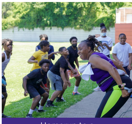
Homerun to a Healthy Weight